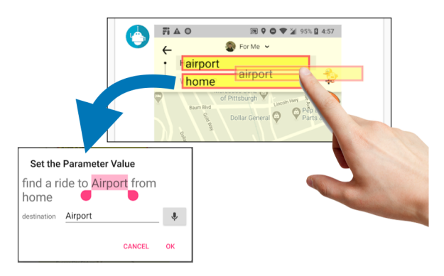
Figure 2. SOVITE provides multiple ways to fix text-input slot value errors: LEFT : the user can click the corresponding highlight overlay and change its value by adjusting the selection in the original utterance, speaking a new value, or just typing in a new value. RIGHT : the user can drag the overlays on the screenshot to move a value to a new slot, or swap the values between two slots.