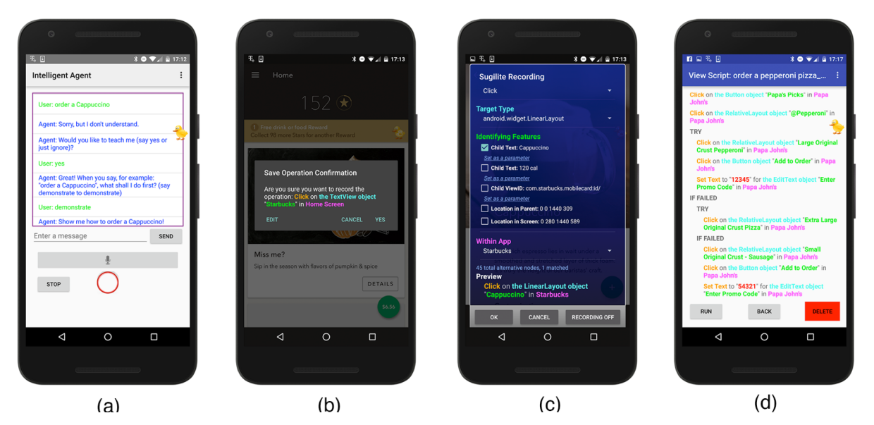
Figure 1. Screenshots of SUGILITE: (a) the conversational interface; (b) the recording confirmation popup; (c) the recording disambiguation/operation editing panel and (d) the viewing/editing script window.

Very few PBD systems exist on smartphones. KEEP DOING IT [26] derives IF-THEN automation rules from the user's demonstration. But it can only invoke system functions like turning on Wi-Fi, setting the ringer to silent, etc. It does not have the ability to control arbitrary third-party apps on the phone like SUGILITE does. To our knowledge, SUGILITE is the first PBD system to allow the automation of arbitrary tasks on any third-party app on a smartphone.