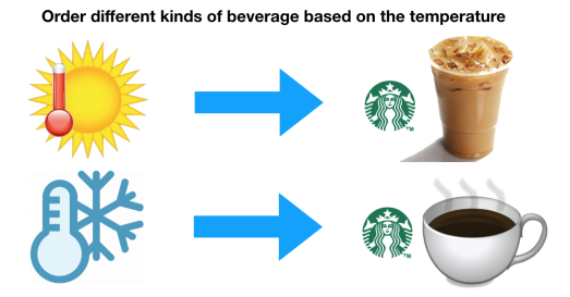
Figure 4. The graphical prompt used for Task 1 – A possible user command can be "Order Iced coffee when it's hot outside, otherwise order hot coffee when the weather is cold."

In order to minimize biasing users' utterances, we used the Natural Programming Elicitation method [36]. Task descriptions were provided in the form of graphics, with minimal text descriptions that could not be directly used in user instructions (see Figure 4 for an example).