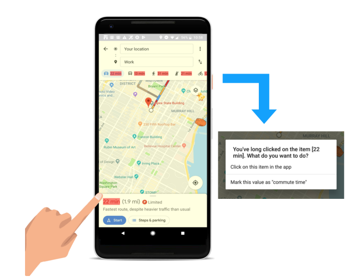
Figure 2. The user teaches the value concept "commute time" by demonstrating querying the value in Google Maps. The red overlays highlight all durations it was able to identify on the Google Maps GUI.

To help the user with value concept demonstrations, PUMICE highlights possible items on the current app GUI if the type of the target concept can be inferred from the type of the constant value, or using the type of value concept to which it is being compared (see Figure 2). For example, in the aforementioned "commute time" example, PUMICE knows that "commute time" should be a duration, because it is comparable to the constant value "30 minutes". Once the user finds the target value in an app, they can long press on the target value to select it and indicate it as the target value. PUMICE uses an interaction proxy overlay [53] for recording, so that it can record all values visible on the screen, not limited to the selectable or clickable ones. PUMICE can extract these values from the GUI using the screen scraping mechanism in the underlying SUGILITE framework [20]. Once the target value is selected, PUMICE stores the procedure of navigating to the screen where the target value is displayed and finding the target value on the screen into its persistent knowledge graph as a value query, so that this query can be used whenever the underlying value